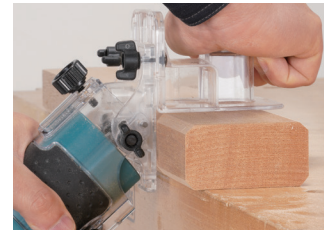
*With Fine depth adjustment