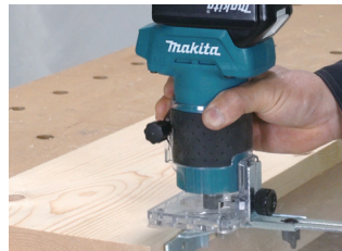
*With Fine depth adjustment

Tilt base for chamfering Part No. 194269-7* Part No. 194270-2