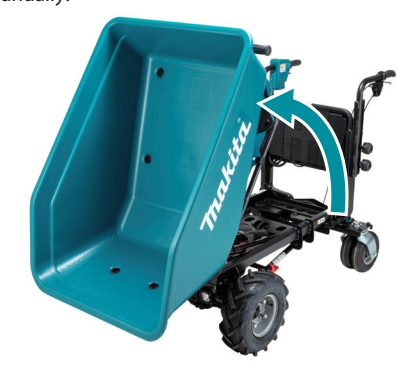
• The electric dump is limited to use on a flat