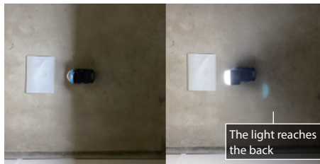
without Lamp shade