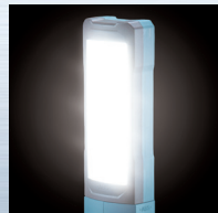
Light diffusing lens