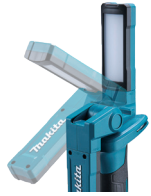
Foldable light head