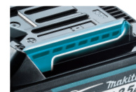
High Rigidity Battery Rails