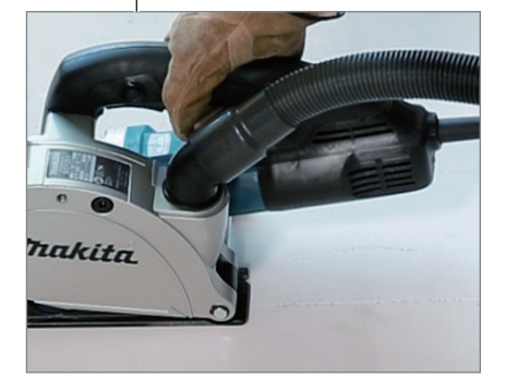
Connectable to vacuum cleaners for clean work environment