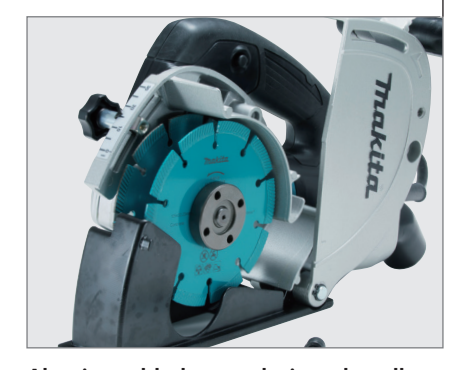
Aluminum blade case designed to allow for easy blade replacement