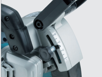
Adjustable cutting depth