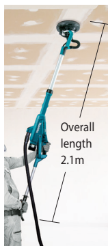
Overall length 2.1m