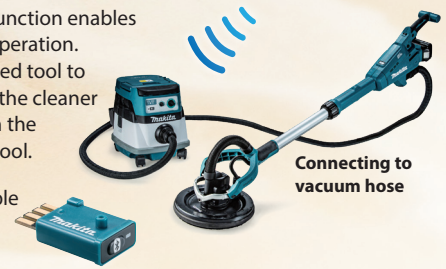
Connecting to vacuum hose

Wireless unit is compatible with all supported tools