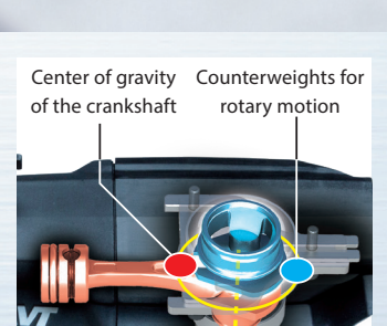
Counterweights for rotary motion

Counterweight to cancel the back-and-forth vibration caused by